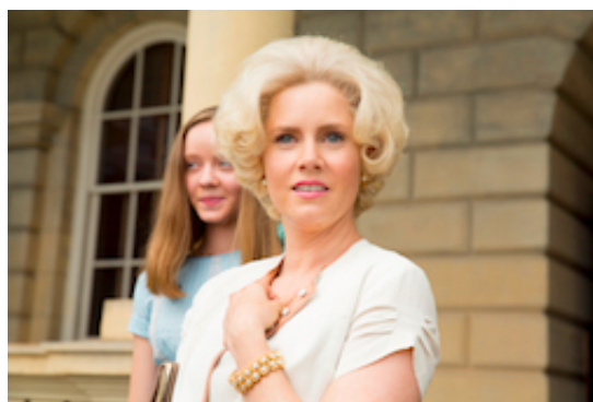
(Click on any of the stills to reach the high rez folder containing these and more stills, bio and resume)